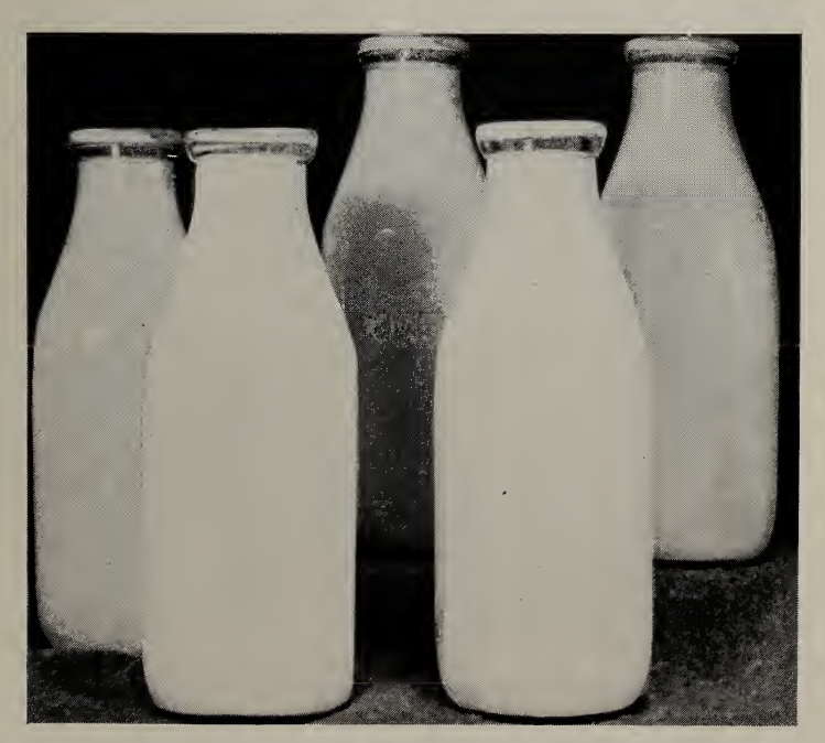
over a million quarts of milk in year ending March 31, 1954.